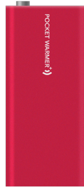
P8430 Pocket Warmer